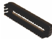
Brush Insert for Nozzle Squeegee