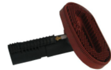
Steam Vacuum Exterior Cleaning Pad