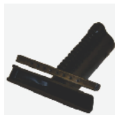
Nozzle Squeegee Steam & Vacuum