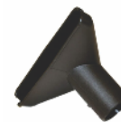
Nozzle for Upholstery