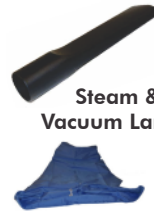
Steam & Vacuum Lance Front Seat Dry Bag