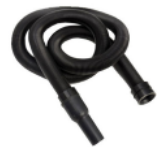
Flexible Hot Air Jet Hose