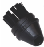
Little PVC Brush for Steam Lance